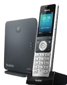
Yealink DECT Cordless